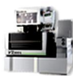
» EDM & EDW